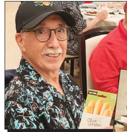
Gift Card Winners