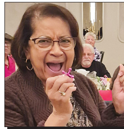
Jacks In The Bag Winner